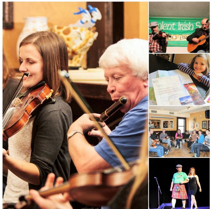
Just a few of CLEF's activities in 2014.