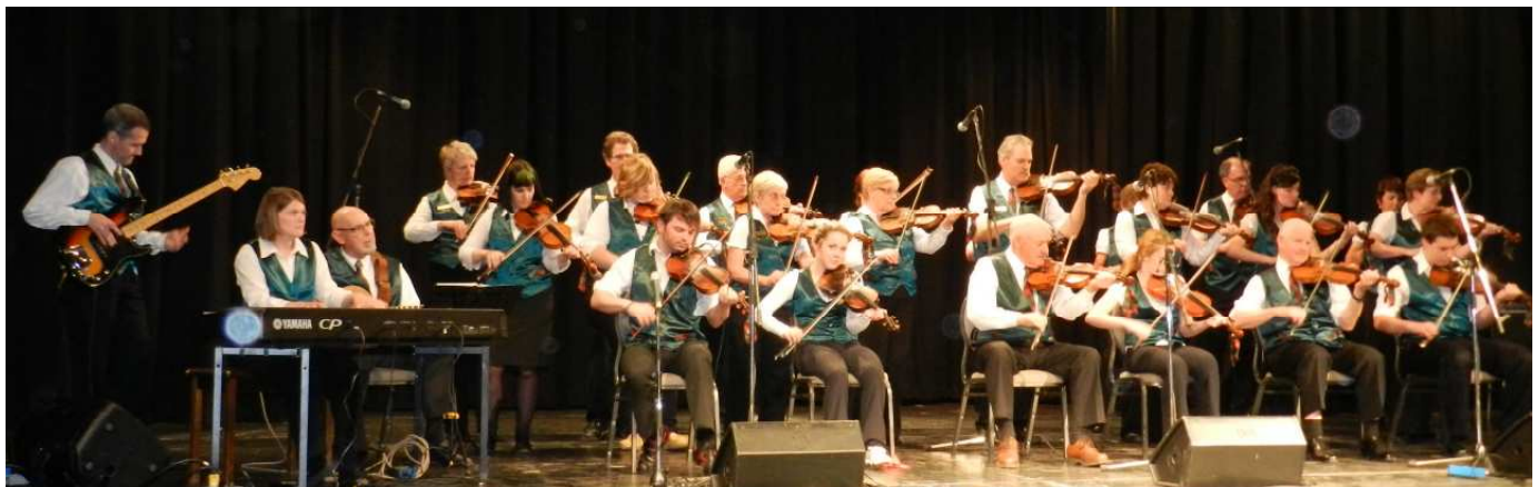
Queens Country Fiddlers at Carrefour Theatre May 6, 2012

Looking ahead into June, the group, as usual, will be moving out of its regular practice location at Queen Charlotte Intermediate School, likely to Andrews of Stratford. In addition, we are already working on tunes for the annual Rollo Bay Fiddle Festival. Also, several members and former members will be involved in regular ceilidhs and concerts throughout the summer months so keep a watch on the local media for where they might be playing. There is never a shortage of great traditional music to enjoy on P.E.I.