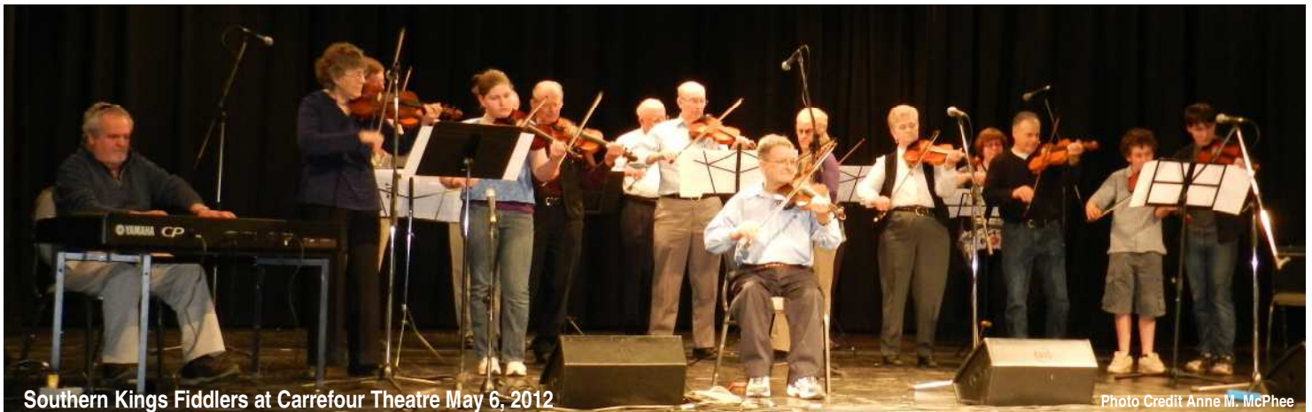
Southern Kings Fiddlers at Carrefour Theatre May 6, 2012