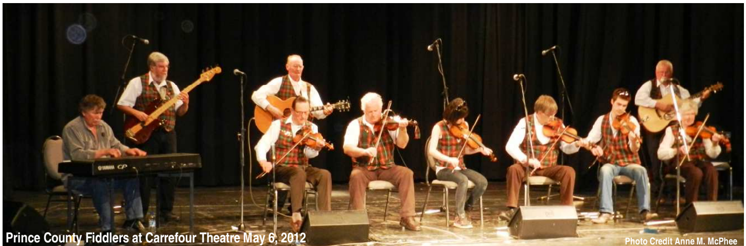
Prince County Fiddlers at Carrefour Theatre May 6, 2012