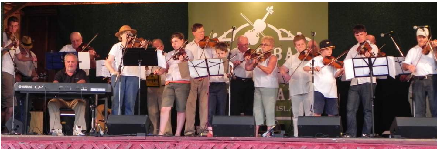
Southern Kings Fiddlers playing at the 35th Annual Rollo Bay Fiddle Festival during the Sunday evening concert.