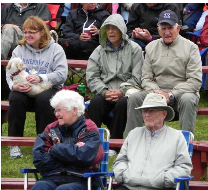
Some loyal fiddle fans have rarely missed a Rollo Bay Fiddle Festival regardless of weather conditions.

PEI Fiddlers Society Annual General Meeting Saturday, October 22, 2011 Benevolent Irish Society 582 North River Road, Charlottetown 3:00pm – PEI Fiddlers Society AGM (All are welcome) 4:00pm – Potluck Supper followed by music (Bring your instruments!)