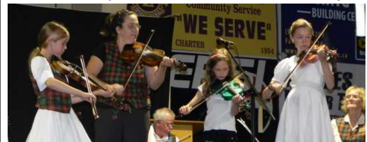
Junior Prince County Fiddlers