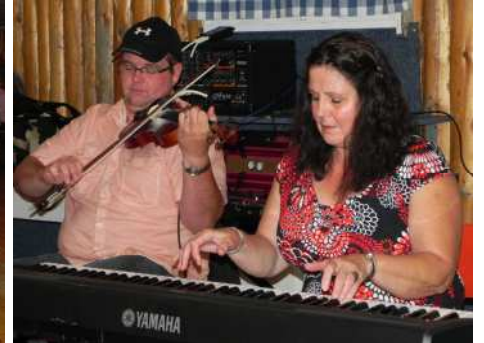
People of all ages enjoy dancing at Island Ceilidhs.