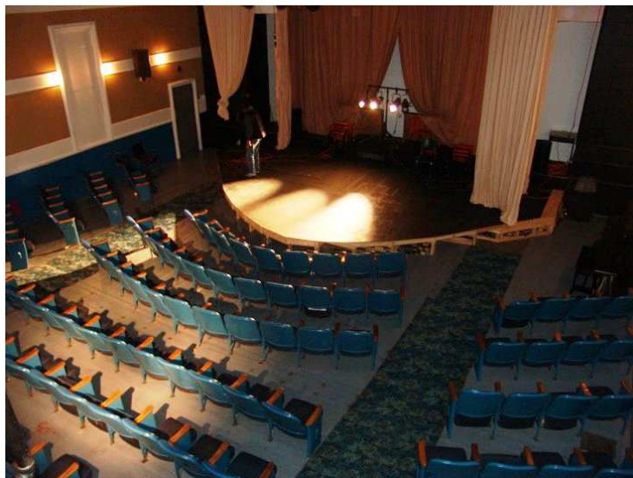
Souris Show Hall is located at 5 Church Street, Souris

The Show Hall has the capacity of 158 theatre seats. With it's wooden construction, amphitheatre cushioned seats, excellent acoustics and sound system it is a wonderful venue for live musical acts, theatre, movies, seminars and workshops. Dedicated volunteers go out of their way to accommodate any need. Their many hopes and plans for the site will indeed create a stellar location for any event. Enquire at (902) 743-SHOW (7469) .