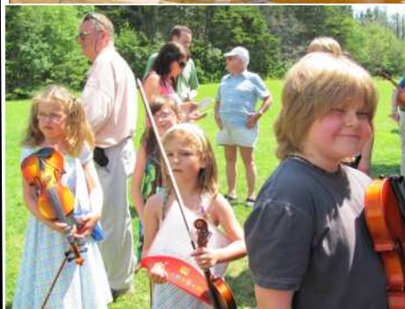
Rollo Bay Beginners Fiddle Students