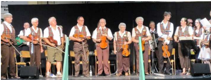
Prince County Fiddlers take a bow after their annual Concert in the Community Gardens in Kensington.