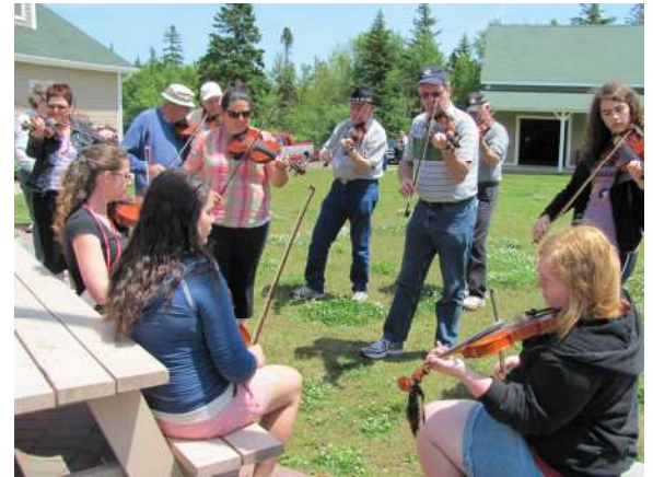
PEI Fiddle Camp participants and instructors hold an afternoon jam session outdoors under blue skies along PEI's south shore.