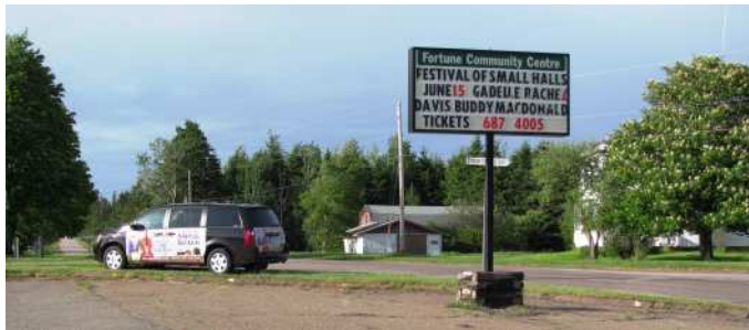
Festival of Small Halls van outside Fortune Hall.

A few of those fiddle events stand out and the organizers must be congratulated. The success of the Festival of Small Halls was unprecedented, astounding the volunteers at the Community Halls that hosted a concert, the members of the audience from across the Island and from away - as well as the performers. While the organizers knew they had a good thing going, in some cases the response from the audience was truly overwhelming and certainly gratifying. No one will want to miss this event next year.