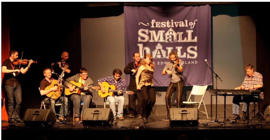
Festival of Small Halls at the Kings Playhouse in Georgetown