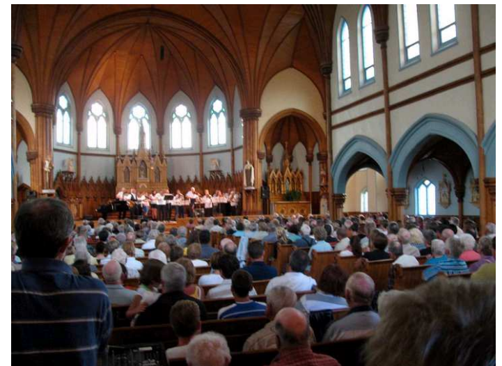
Indian River Festival Island Ceilidh was held in St. Mary's Church to a standing room only crowd.