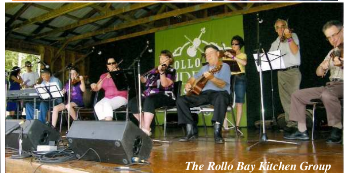
The Rollo Bay Kitchen Group