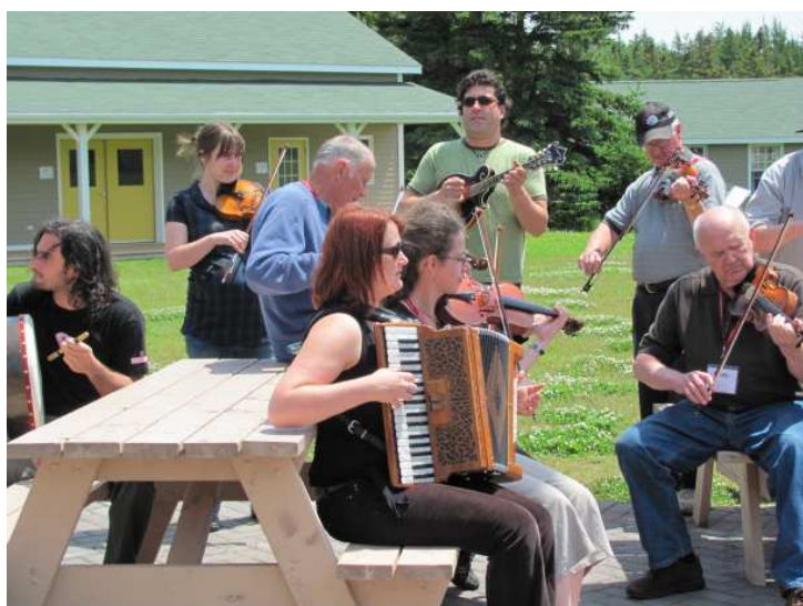
Students and instructors jam outdoors at PEI Fiddle Camp