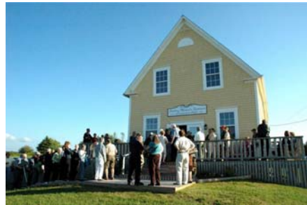
One of the many small halls on PEI

A PEI Traditional Music Festival: Coming to a Small Hall near you! June 11 - 20, 2010. More details coming soon!