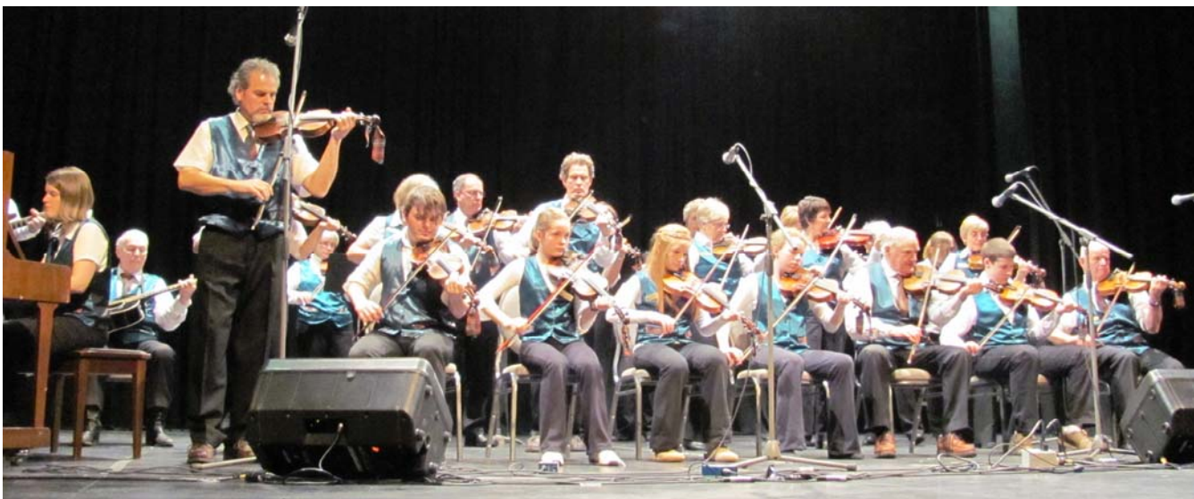
The Queens County Fiddlers played to a large crowd for the Annual Hospice Ceilidh at the Carrefour Theatre Feb 21st.