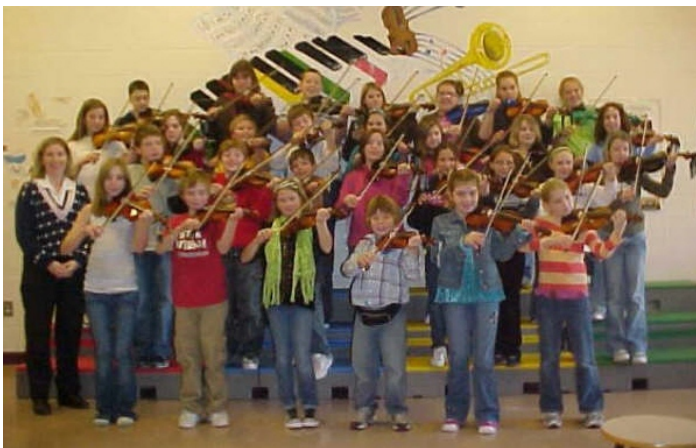
Fiddle Students at Donagh Regional School