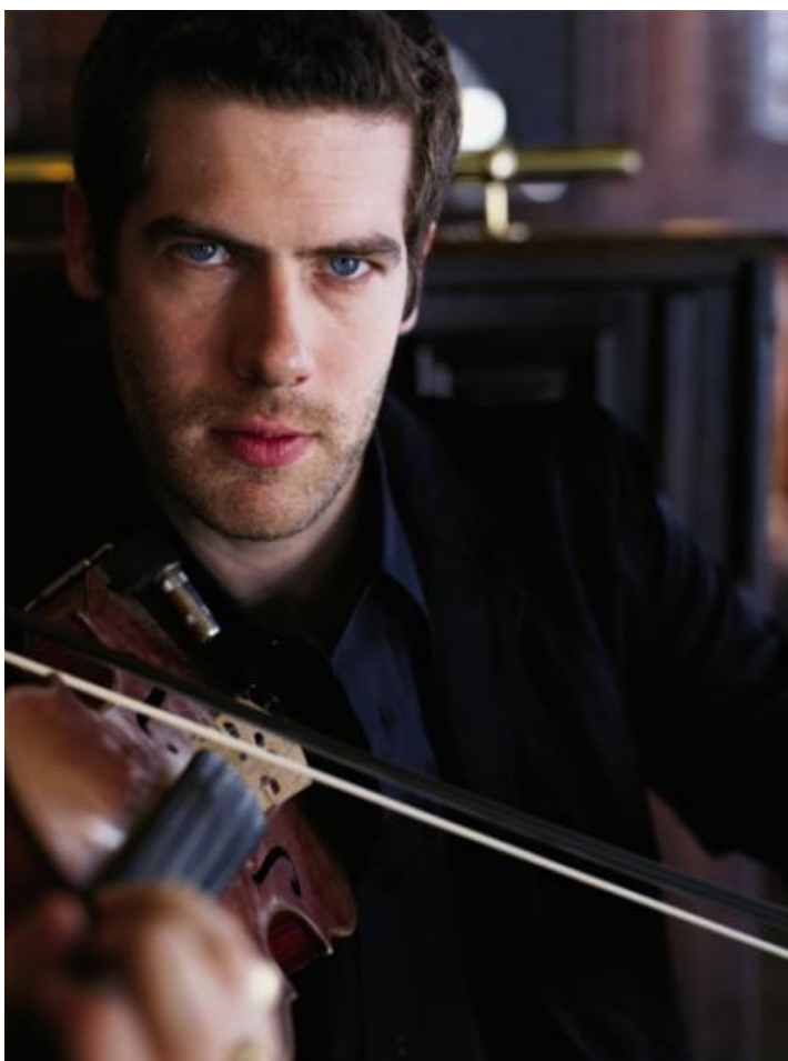
Cape Breton's Ashley MacIsaac headlines an impressive lineup for the Rollo Bay Fiddle Festival.