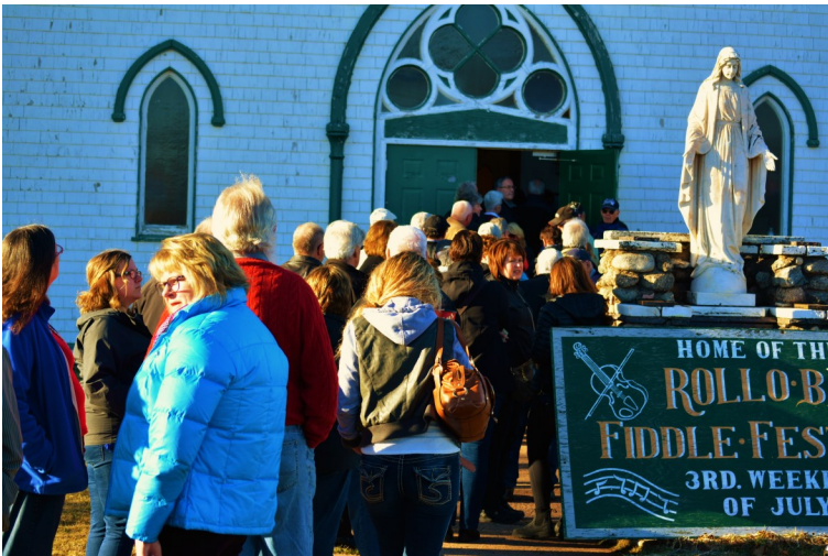
350+ supporters turned out for Rollo Bay Fiddle Festival fundraiser April 22 at the de-commissioned St. Alexis Church in Souris (story page 6).