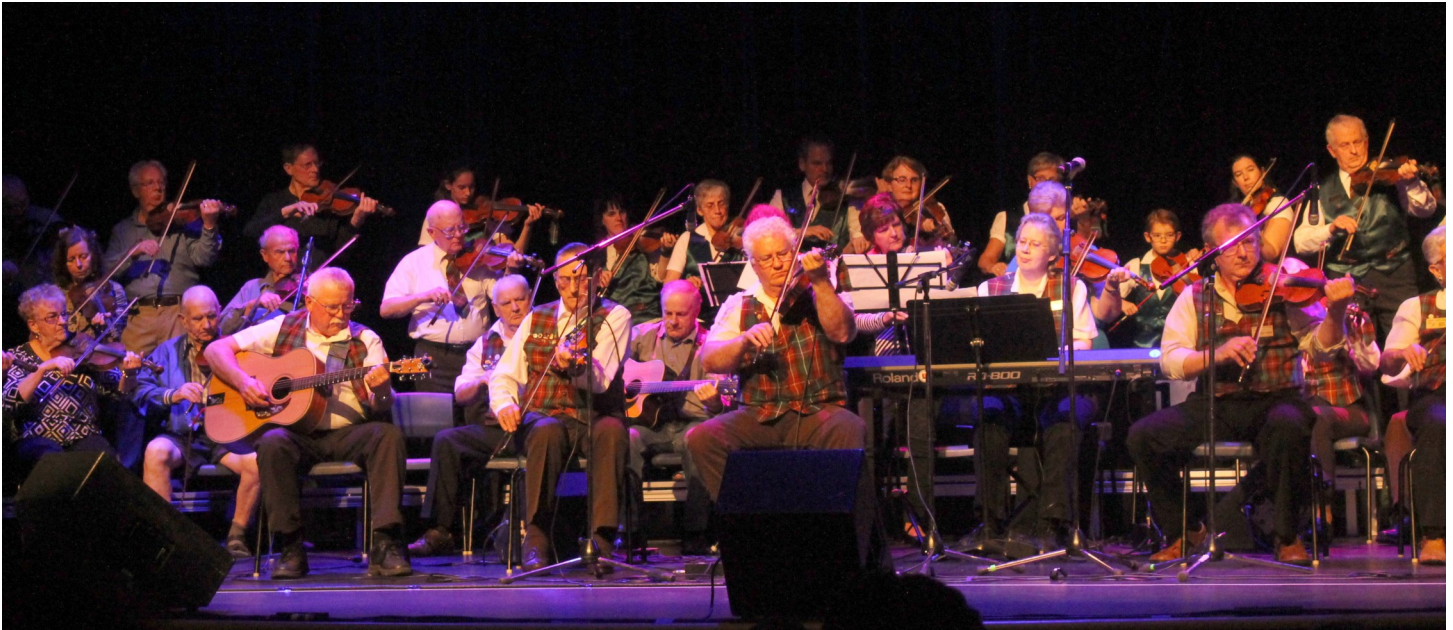
Fiddlers across the Island joined together to celebrate National Fiddling Day May 21st at Harbourfront Theatre in Summerside.