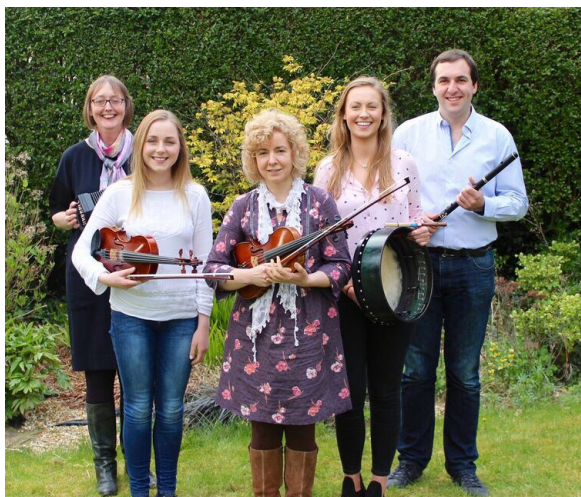
LUASCADH is a five person Irish traditional group embodying the spirit of Irish Culture