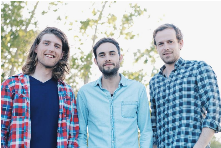
The East Pointers will perform at the 40th Rollo Bay Fiddle Festival July 15-17.

"We came to the conclusion that not only could we get this 40 th festival happening, but it must continue for another 40 years." - JJ Chaisson