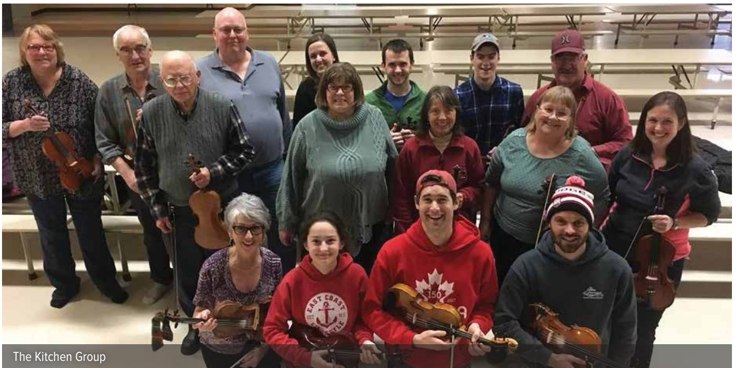
The Kitchen Group